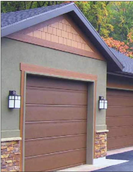
Martin Flushline model door with Rusty Iron powder coat finish