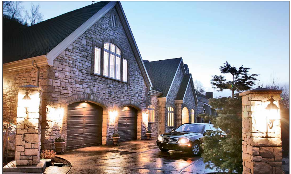
Martin Ranch model door with bronze metallic powder coat finish