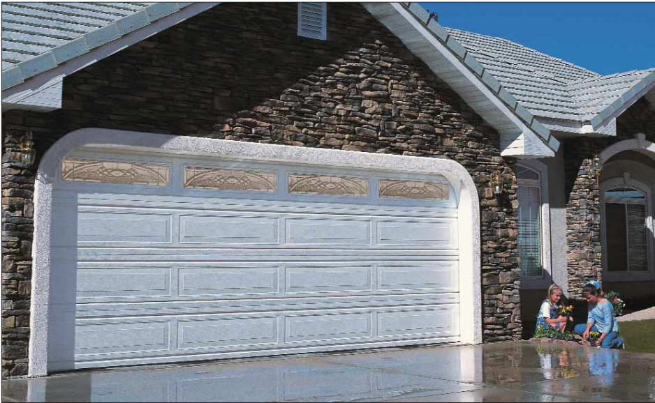
Martin Ranch model door with Amore ® Vista windows