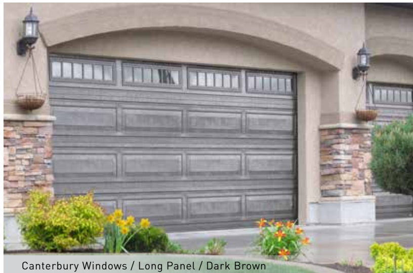
Canterbury Windows / Long Panel / Dark Brown