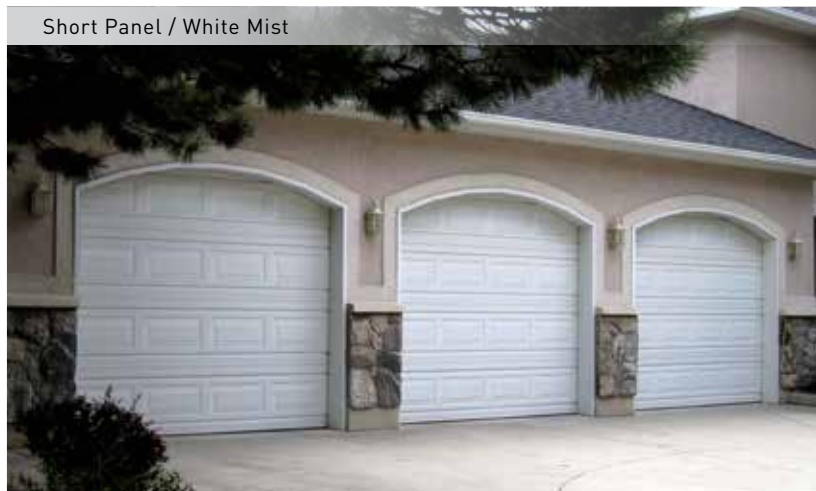
Short Panel / White Mist