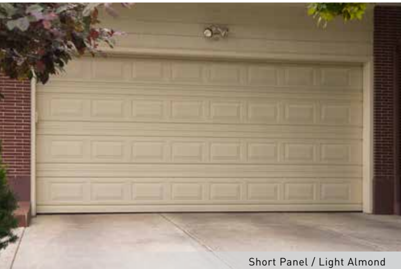
Short Panel / Light Almond