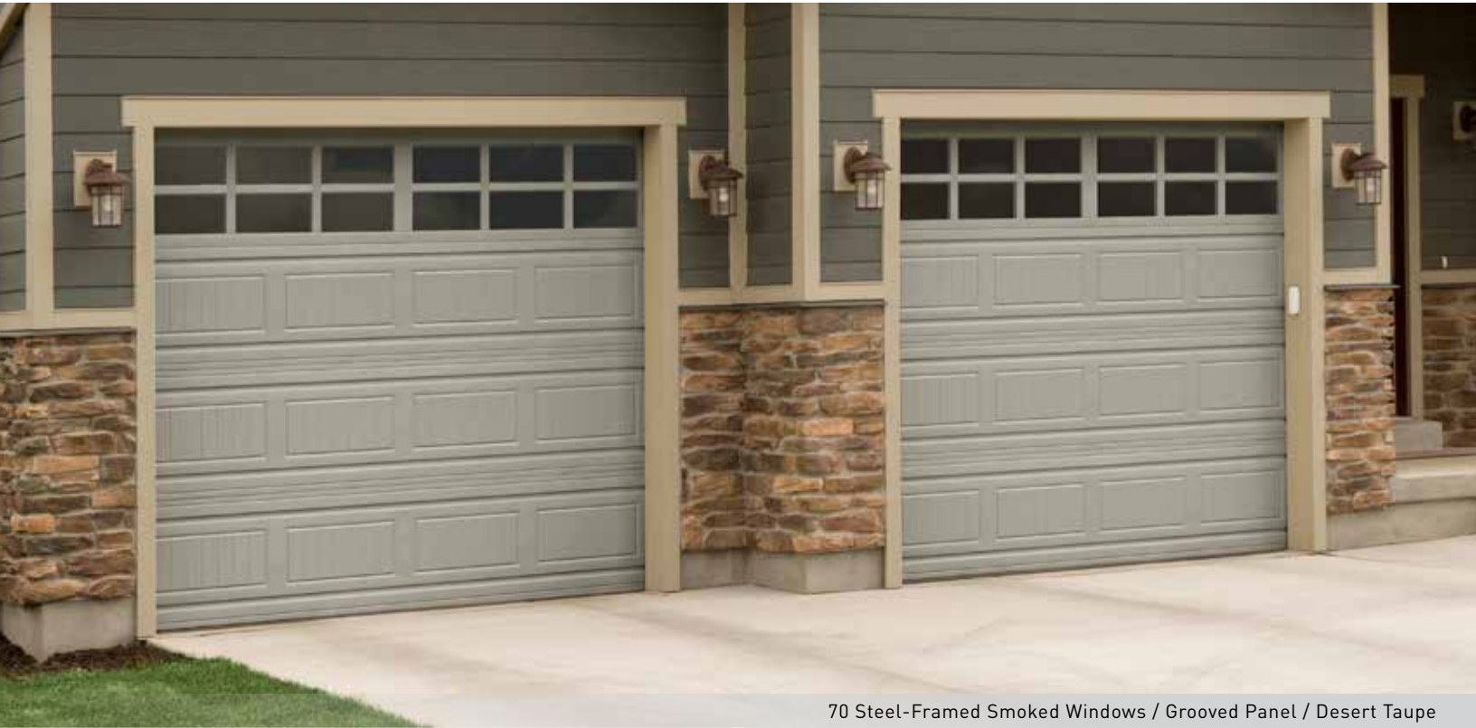
70 Steel-Framed Smoked Windows / Grooved Panel / Desert Taupe