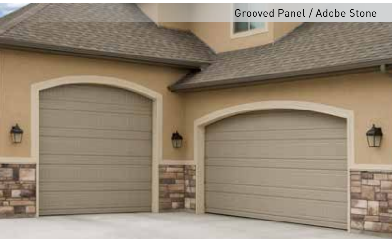
Grooved Panel / Adobe Stone